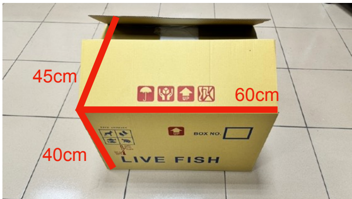
Front view of box