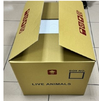
Box side view